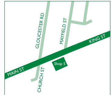
QDI X-ray Rooms Shop 5, 12 King Street