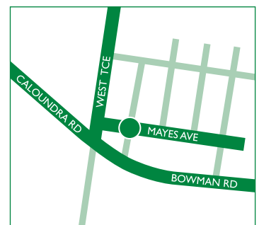
QDI X-Ray rooms 18 Mayes Avenue